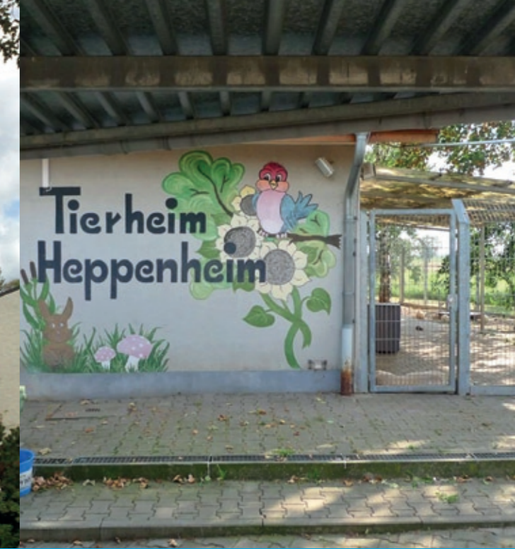
Animal Shelter in Heppenheim