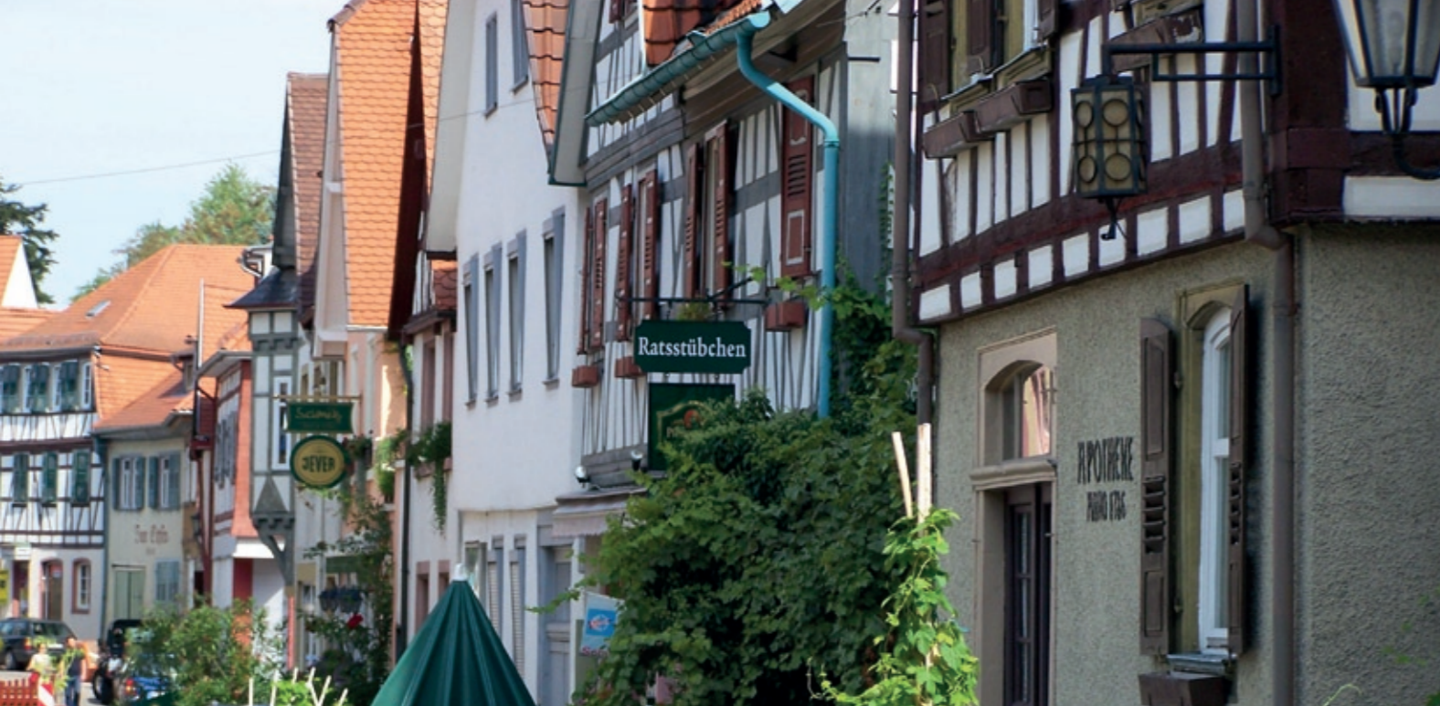
Half-timbered Houses in Zwingenberg