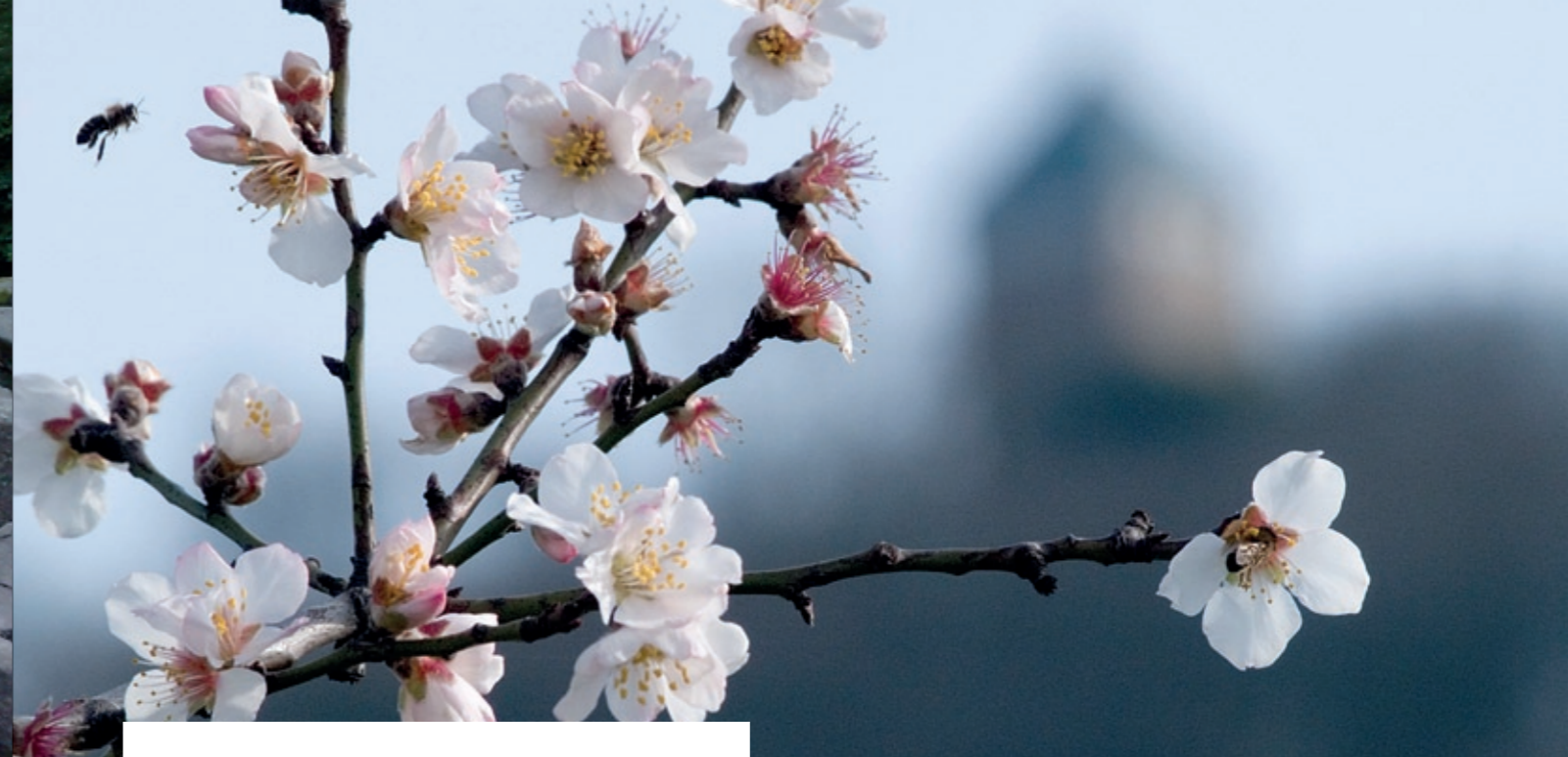
Spring at the Bergstrasse