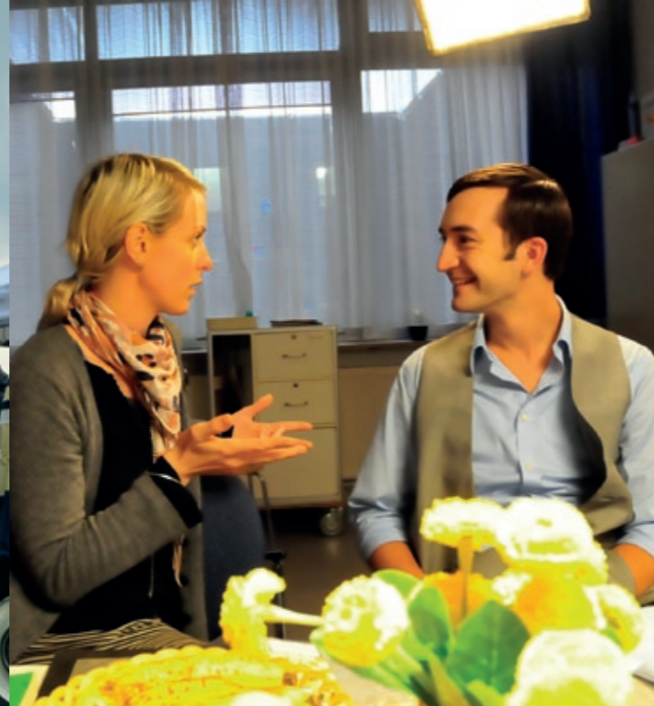
Shooting "Cindy Does Not Love Me" at Heilig-Geist-Hospital in Bensheim