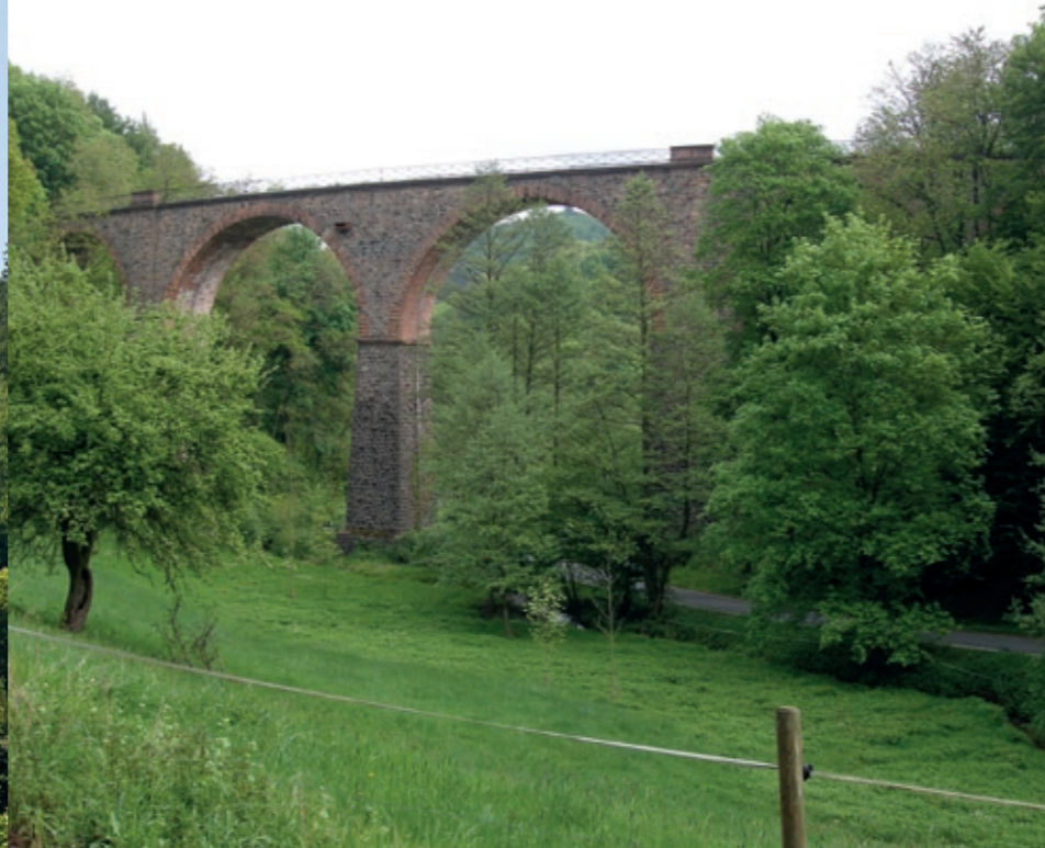
Ueberwald Railway Viaduct