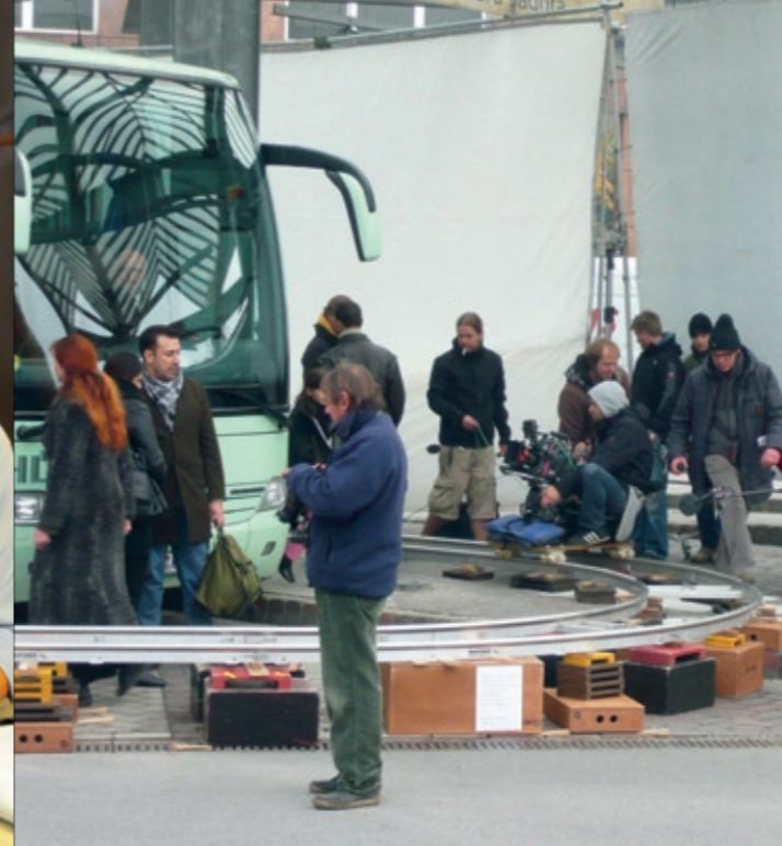
Shooting "A Quiet Life" at the Bus Station in Bensheim