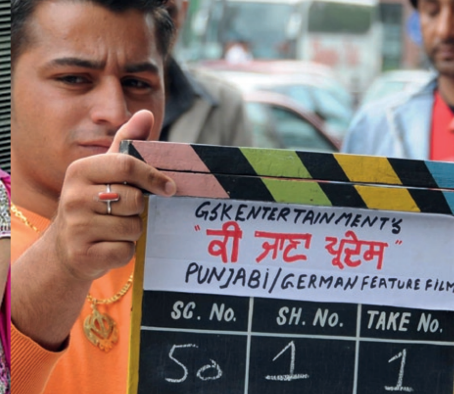
Shooting "Kin Jana Pardes"