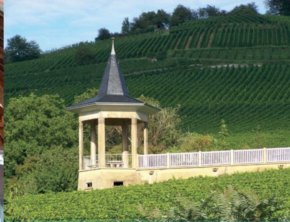
Vineyards at the Bergstrasse