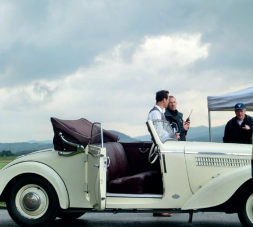
Shooting "Max Schmeling" near Lorsch