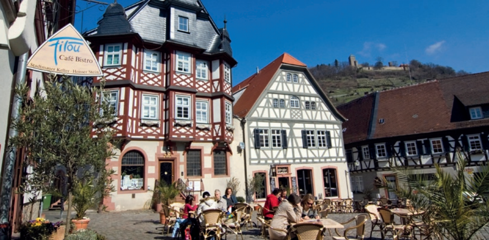
Ancient Market Place in Heppenheim