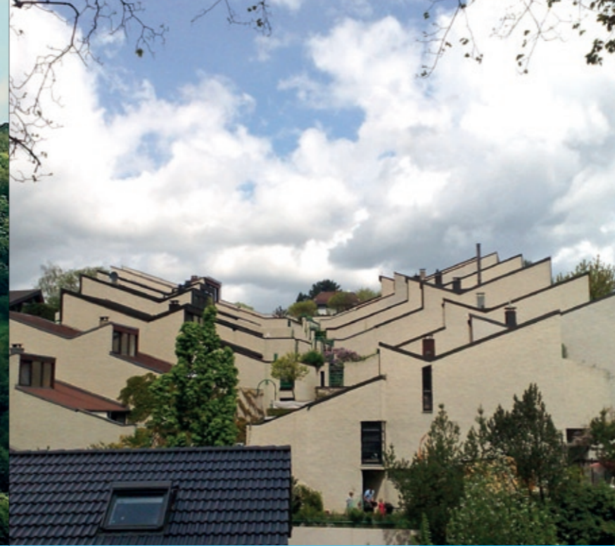
Housing Estate in Zwingenberg