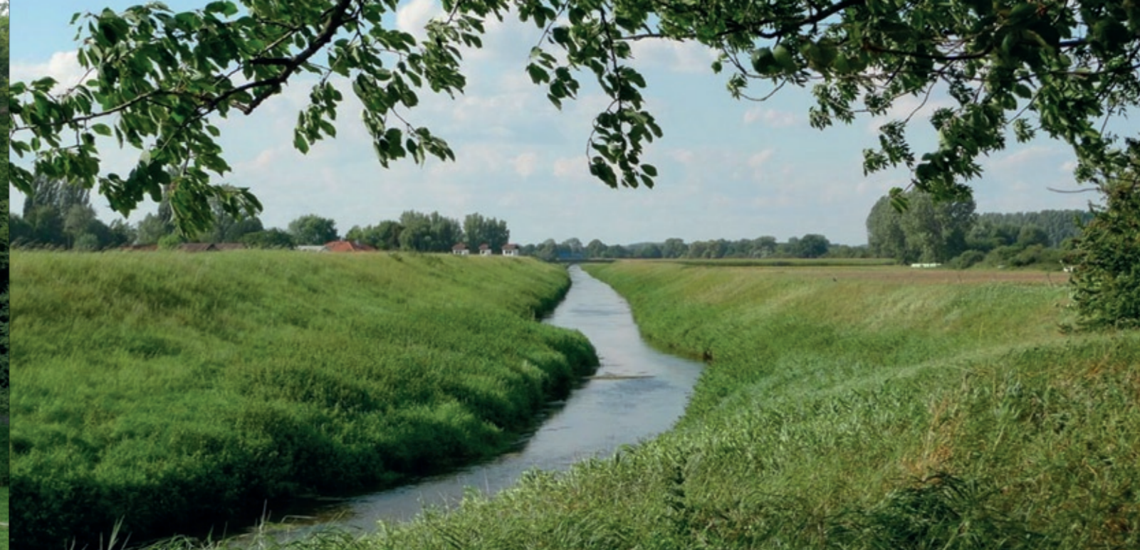
Hessian Ried Landscape

Children between three and six years old may only work for two hours a day in the hours between 8 a.m. and 5 p.m. Children over six can film for three hours a day in the hours between 8 a.m. and 10 p.m. The children must be chaperoned on set by either a parent or a teacher.