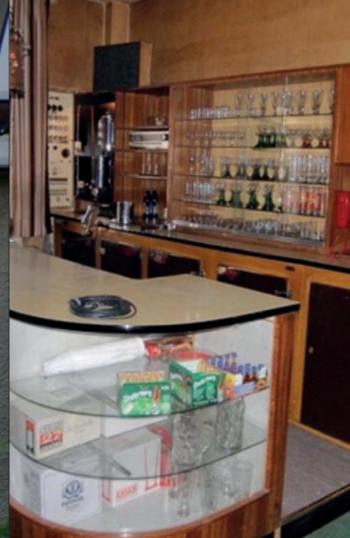
1950's Cinema in Heppenheim