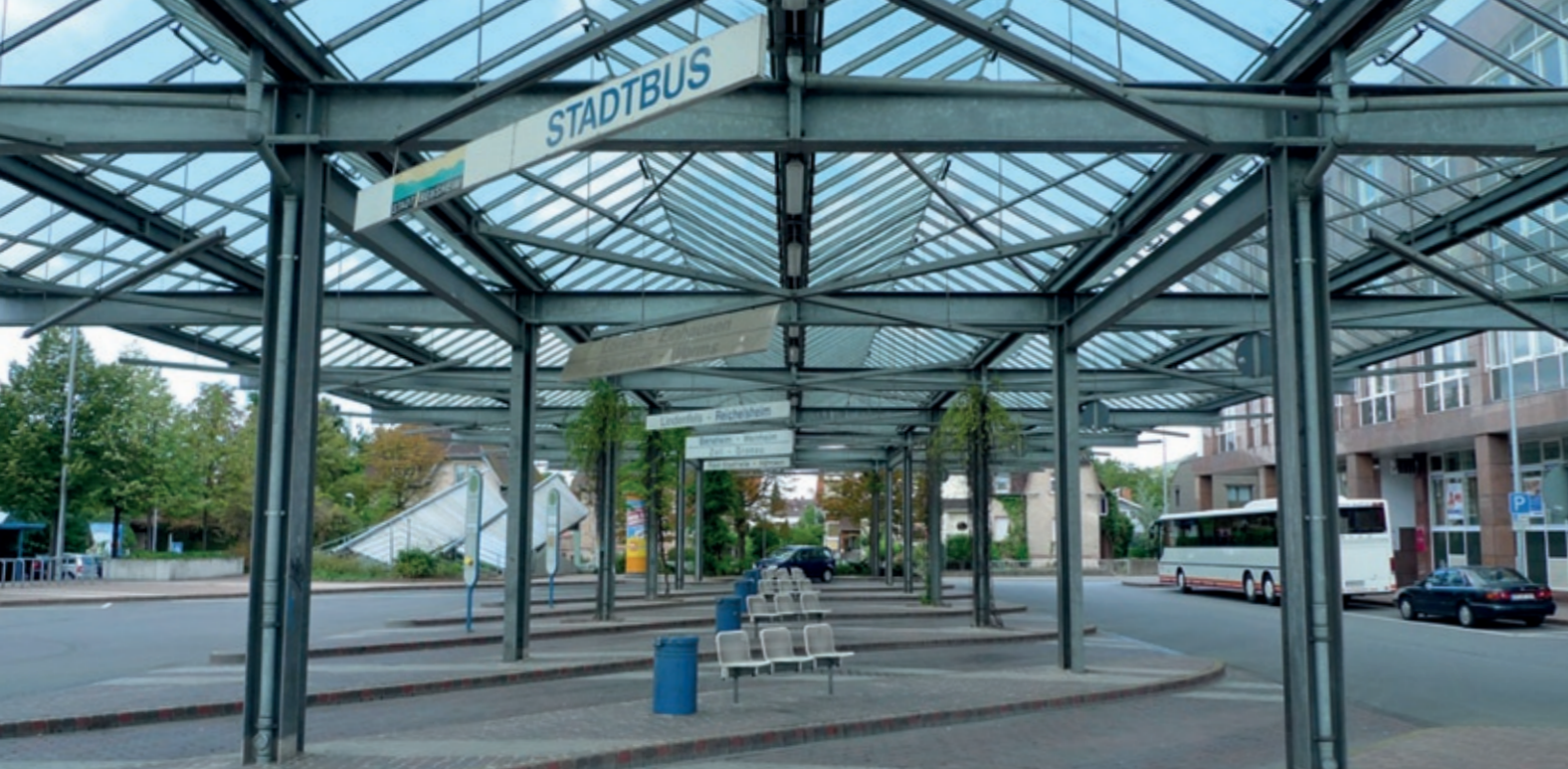
Bus Station in Bensheim