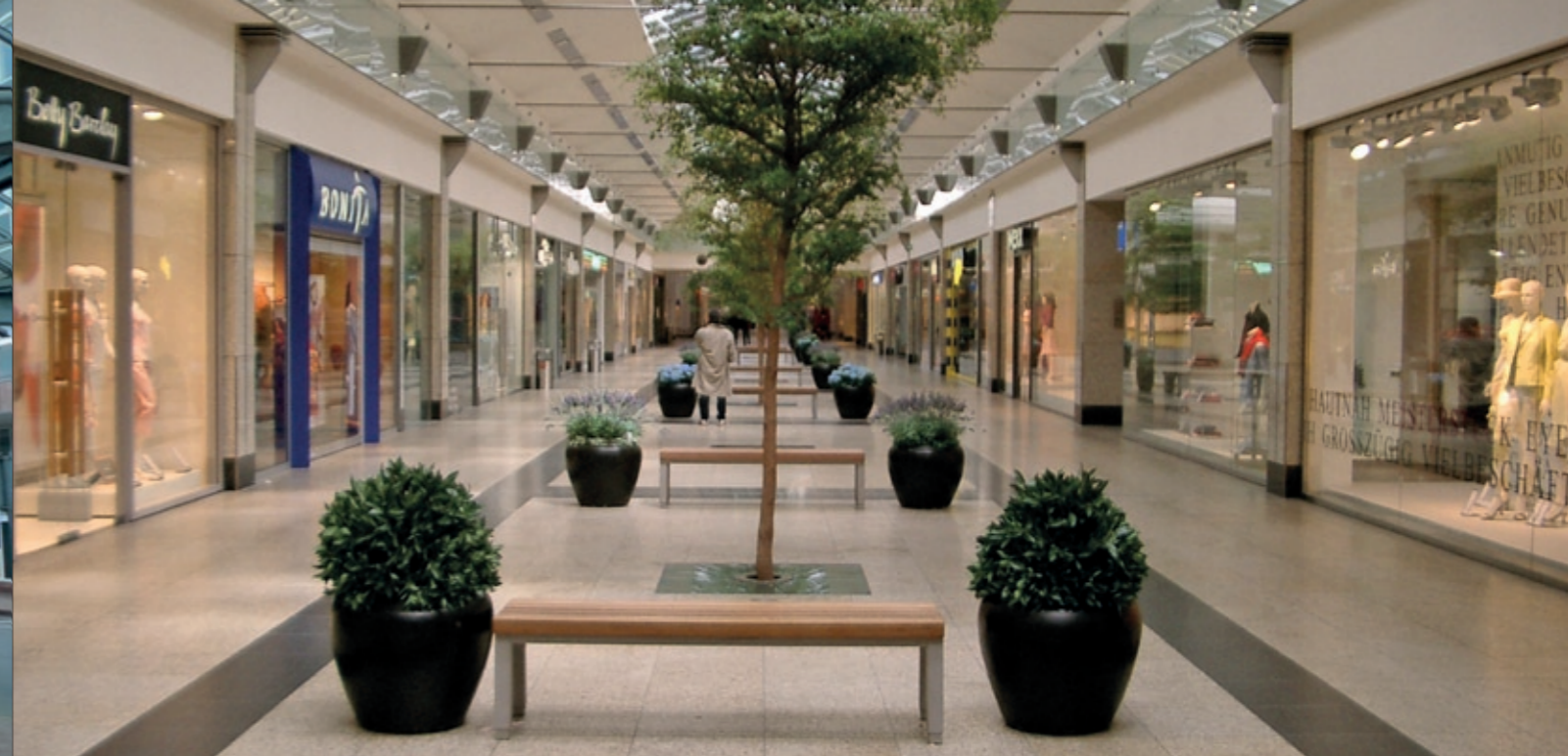
Rhine-Neckar Shopping Centre