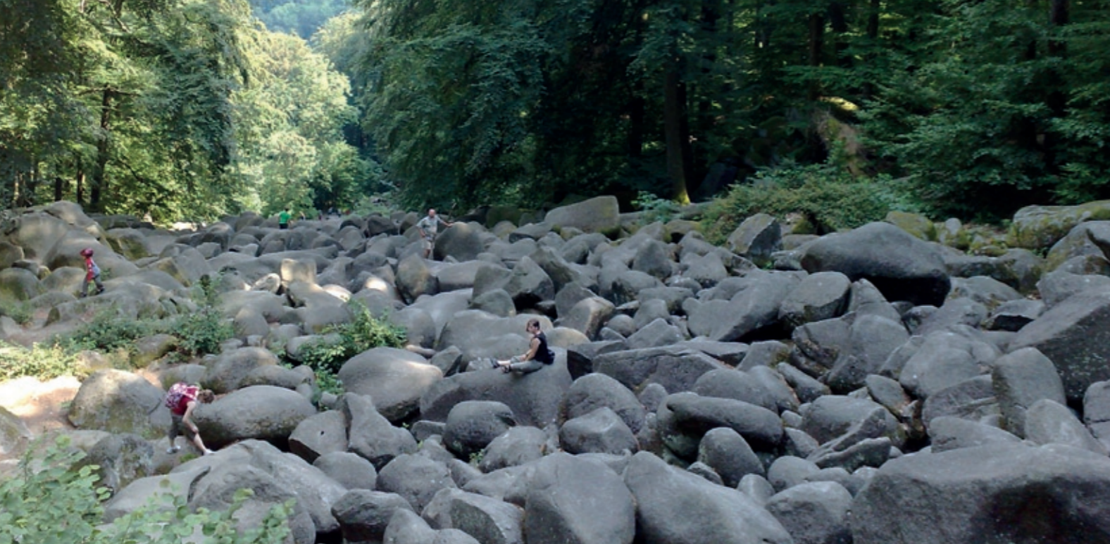
“Felsenmeer” in Lautertal/Odenwald